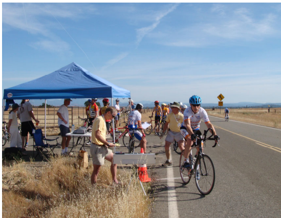
Time Trial Training Series, Stage 1 on Millville Plains Rd. Are you ready for Stage 4?